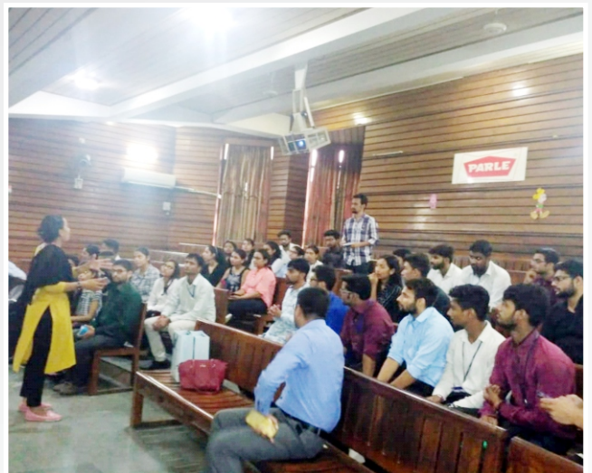
Parle G Plant