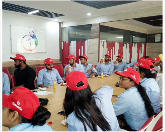
Ananda Diary Plant